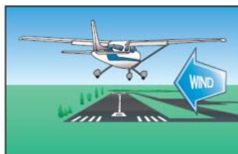
Small Aircraft Crosswind Landing Diagram

Wind coverage is important to airfield configuration and utilization. Aircraft ideally takeoff and land into a headwind aligned with the runway orientation. Aircraft are designed and pilots are trained to land aircraft during limited crosswind conditions. Small, light aircraft are most affected by crosswinds. To mitigate the effect of crosswinds, FAA recommends runways be aligned so that excessive crosswind conditions are encountered at most 5 percent of the time. This is known as a “95 percent wind coverage” standard. Each aircraft’s AAC-ADG combination corresponds to a maximum crosswind wind speed component.