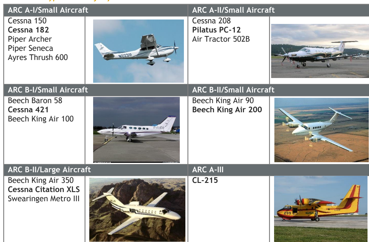
Exhibit 4-1 Typical Aircraft by ARC