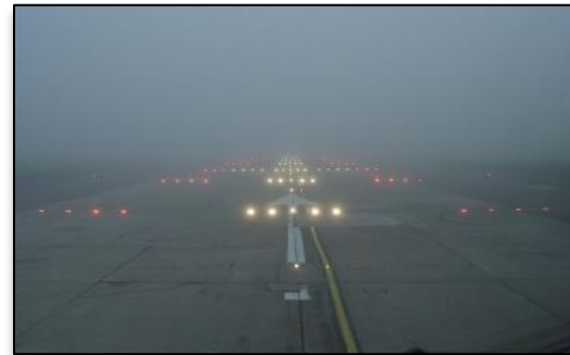
Low Visibility Airport Operations

Current GPS instrument approach weather minimums are 357-foot cloud ceiling and 1 ¼ mile flight visibility for both Runway 16 and 34. Weather conditions are broken down into occurrence percentages based on current instrument approach minimums in Table 4-15 .